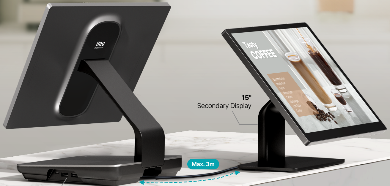
NOVA POS Main System

Auxiliary monitors in various sizes and mounting options! perfect for order/payment verification, advertising, and KDS integration.